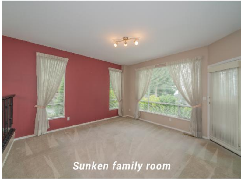
Sunken family room

The spacious open-concept living room hosts a corner gas fireplace (serviced September 2020) on the main level with a skylit dining room and sunken family room all for entertaining guests. Enjoy your morning coffee & evening BBQ's on the south-facing spacious private deck. In-suite laundry, newer water tank (installed August 2017), double garage & plenty of storage throughout. Enjoy a little nature from your private fenced yard from the walkout basement. The fireplace has been serviced and the carpets professionally cleaned (September 2020). The strata allows for 1 dog or 1 cat and 6 of 65 rentals.